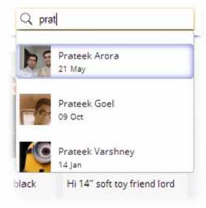
Figure 1.7 Autocomplete search

The other functionality of application is autocomplete customized search. Autocomplete search involves predicting a word or phrase that the user wants to type in without the user actually typing it in completely.