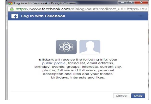
Figure 1.2 Permission Dialog

For requesting these permission is to enable the application to pre-calculate the gift recommendations for the user and its friends.