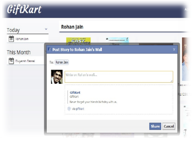
Figure 1.4 Timeline message

From the home screen user has four options. First one is to click on one of the friends to see their gift recommendations. Second one is to click on the right hand side icon to visit their profile. Third one is to write "Happy Birthday" on user's friend timeline. And the last one is autocomplete customized search.