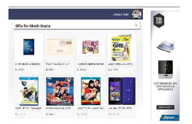
Figure 1.6 Gifts for Akash Gupta

The other functionality of application is autocomplete customized search. Autocomplete search involves predicting a word or phrase that the user wants to type in without the user actually typing it in completely.