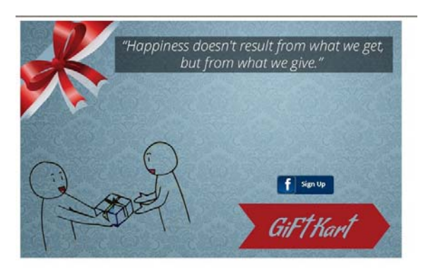
Figure 1.1: Welcome Screen

A Facebook user can discover the application either by searching for it or by getting invited by a friend to use Giftkart. Currently, Giftkart is running as a web-app managed by the user's Facebook account. The user cannot access the app's data unless he/she authorize the app with their active Facebook account. The app starts with a welcome page as shown below.